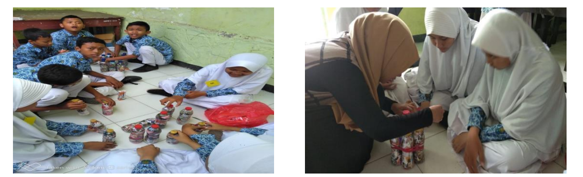
Figure 5. Ordering the Plastic Bottles to Create Vase