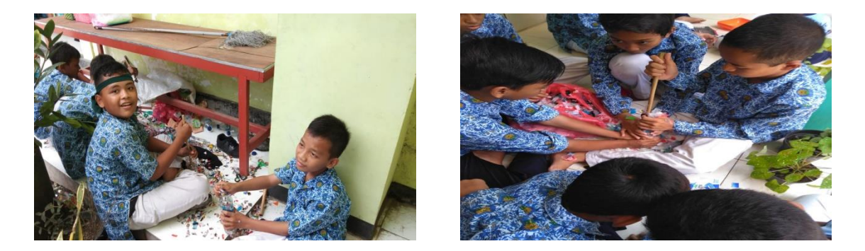
Figure 3. Doing the Project of Ecobrick by filling the bottle with plastic waste

STEAM is a meta-discipline that integrates science, technology, engineering, art and mathematics into an integrated approach that is implemented in school trips (Rahmadana & Agnesa, 2022). STEAM is a learning approach by integrating it with various models, methods and techniques in learning. The results of the analysis show that biology learning with STEAM is taught from a multidisciplinary perspective, by trying to integrate the biology learning topics being taught with various activities related to the five aspects of STEAM. The Science aspect is represented by the material Analyzing the occurrence of Environmental Pollution and its Impact on Ecosystems. This material discusses pollution that occurs in the environment, starting from air pollution, water pollution, soil pollution, and the impact of pollution on ecosystems. One of the main problems is related to plastic waste which is increasingly piling up. Because plastic cannot decompose by itself, students are asked to make projects related to plastic waste management, namely with Ecobrick. Each group of students is asked to make their own projects according to the ideas formed together. The student group designs related to waste management with ecobrick, starting from what form will be developed, what tools and materials are needed, the division of tasks in groups, and must complete with certain targets according to the time given by the teacher (Priantari et al., 2020).