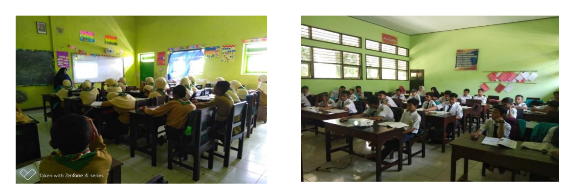
Figure 2. Explaining to Student to Plan the Ecobrick Project